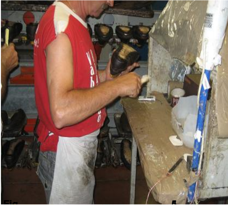
Manual finishing station