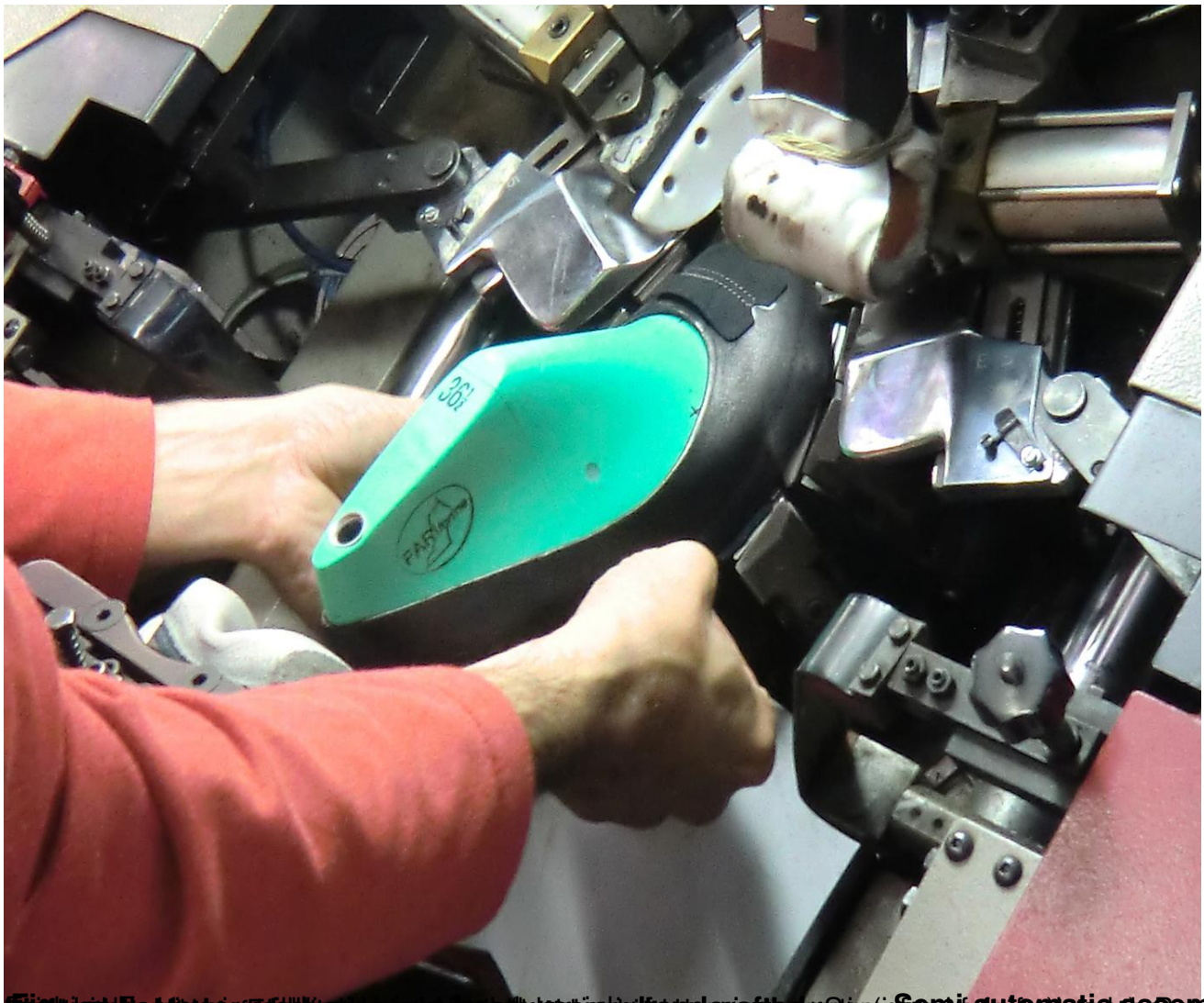
Figure 15: Semi-automatic assembly operation