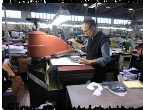
Figure 16: Manual cutting of leather parts